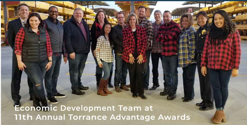
Economic Development Team at 11th Annual Torrance Advantage Awards

Torrance is a premier city, balancing the commercial, industrial and residential sectors. Our mission is to help existing businesses grow, attract new investment, strengthen infrastructure and improve the economic base. Our Economic Development Team includes staff with a range of expertise to help with all aspects of doing business in Torrance.