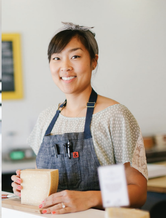
Milkfarm, Los Angeles • Est. 2014 milkfarmla.com