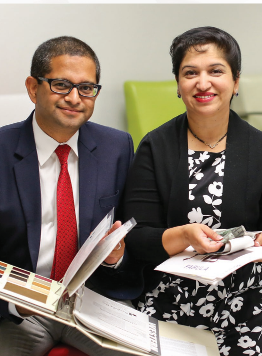
Aura by Murti, LLC, Torrance • Est. 2010 auraseating.com