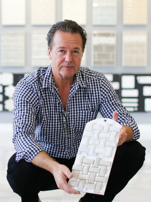
Bentley Adams Tile, Santa Monica • Est. 2016 bentleyadamstile.com